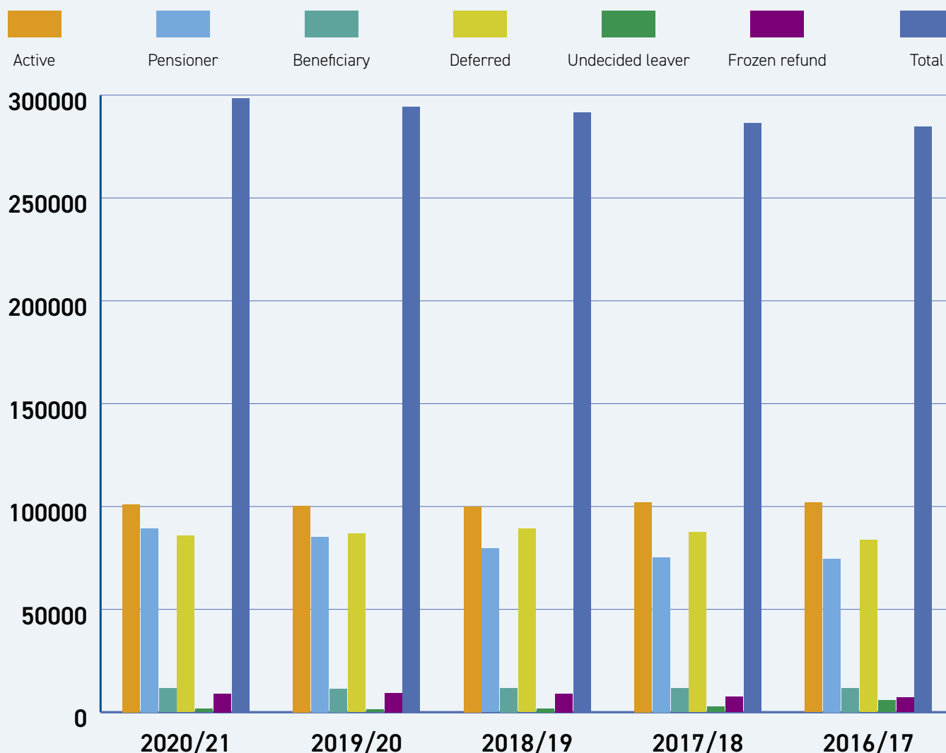
Membership trends over a five-year period

Fund membership continues to grow, with a total membership, including undecided leavers and frozen refunds, of 298,307 as at 31 March 2021. Active members are employed by 451 separate organisations.