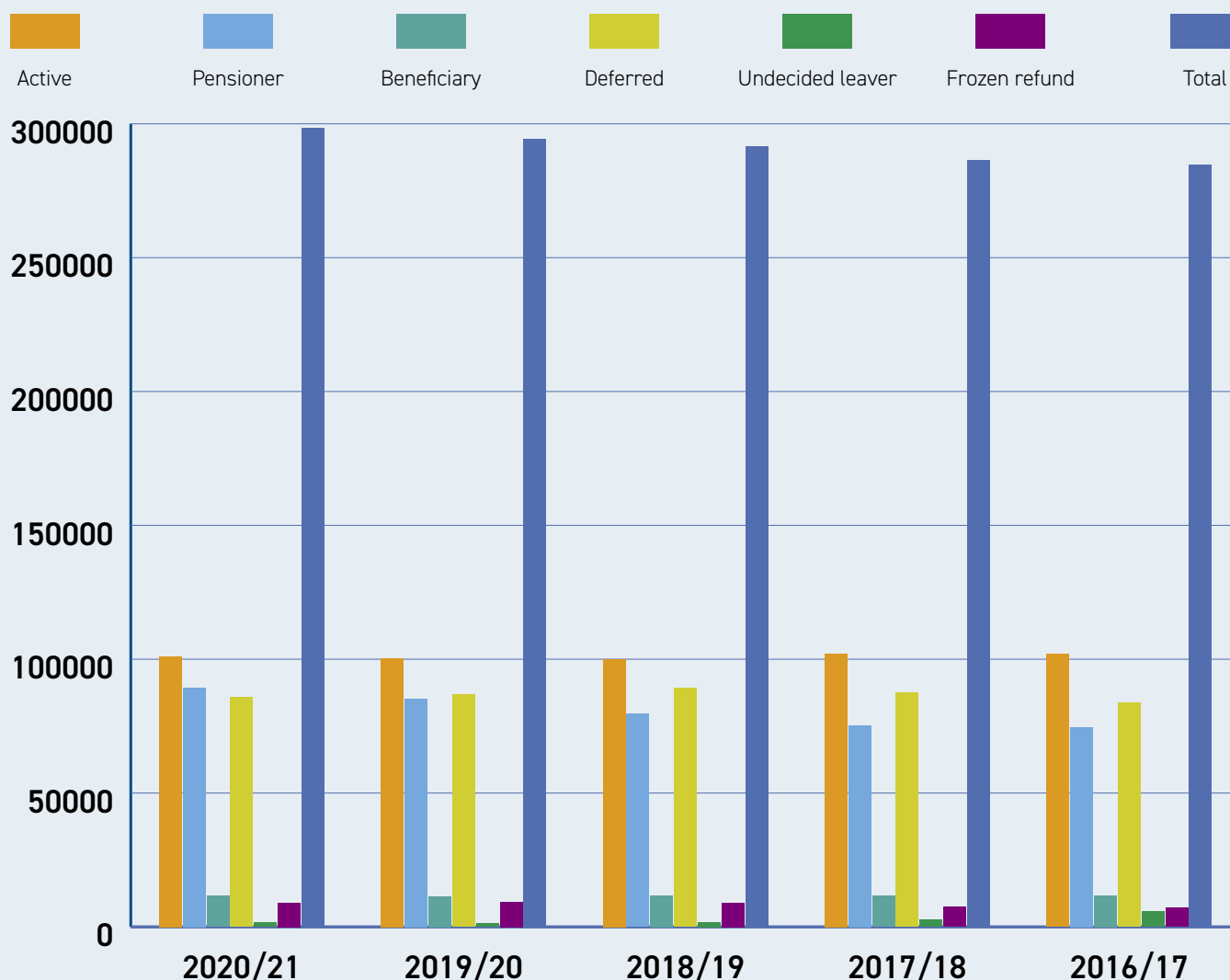
Membership trends over a five-year period

Fund membership continues to grow, with a total membership, including undecided leavers and frozen refunds, of 298,307 as at 31 March 2021. Active members are employed by 451 separate organisations.